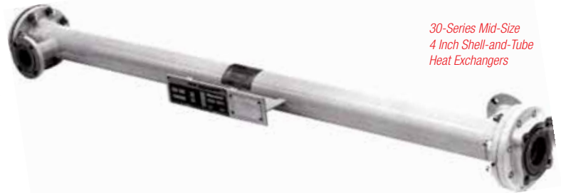
30-Series Mid-Size 4 Inch Shell-and-Tube Heat Exchangers

AMETEK 30-Series Shell-and-Tube Heat Exchangers are single pass, typically counter current flow designs incorporating flexible fluoropolymer tube bundles joined together to form integral honeycomb tube sheets. Units are available with FEP, PFA or Q-Series tubing, all with fluoropolymer-lined heads.